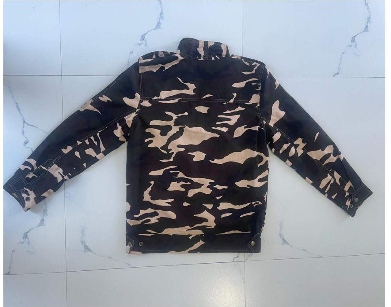
Pic. 2 - Warm Camouflage Jacket