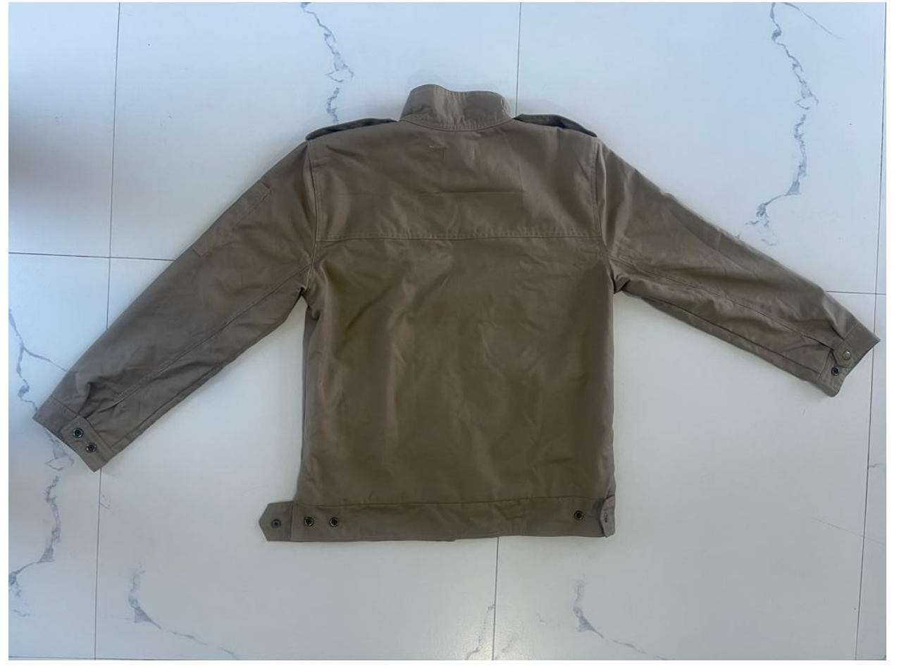
Pic. 1 - Warm Khaki Jacket