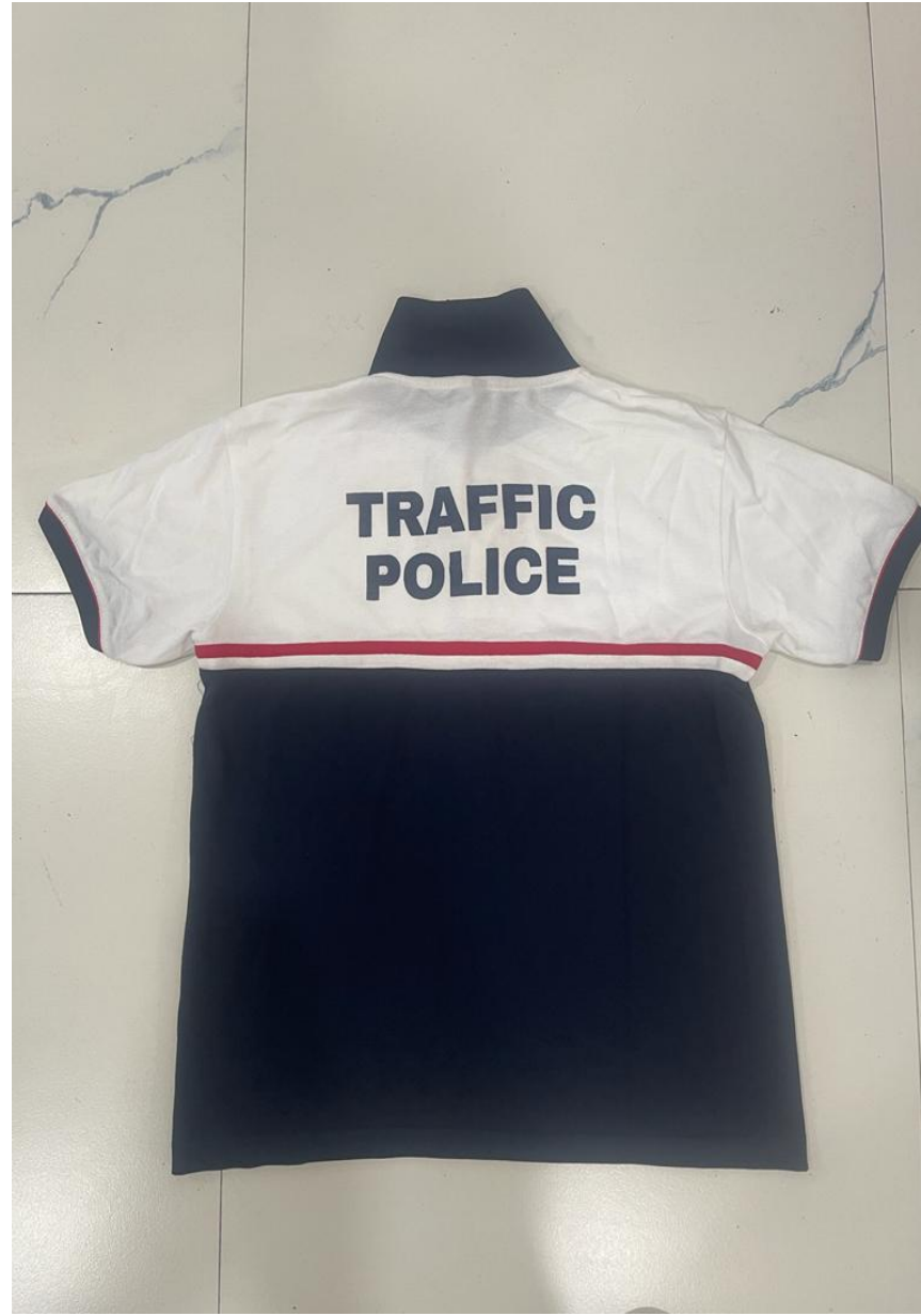
Pic. 3 - Traffic Tshirt