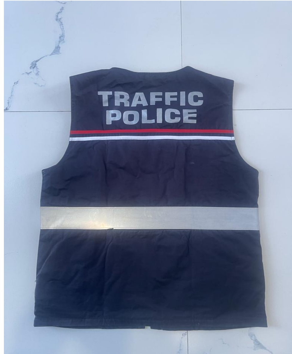
Pic. 4 - Sleeveless Jacket for Traffic